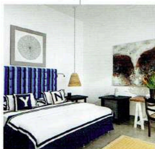
KK BEACH Sri Lanka

BOOK IT Double, from £116, incl. breakfast (relaischateaux.com).