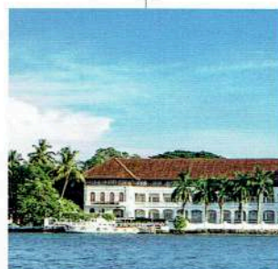
BRUNTON BOATYARD Kerala, India

BOOK IT Double, from £230, incl. breakfast (kkbeach.com).