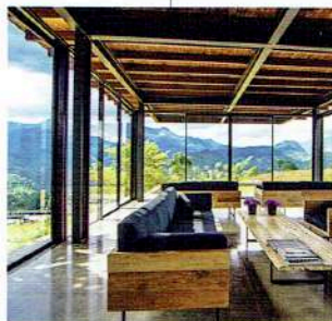
SANTANI Sri Lanka

Winding your way up through endless, jungle-smothered hills, you wonder if you're ever going to make it to Santani, a glossy new wellness resort near Kandy.