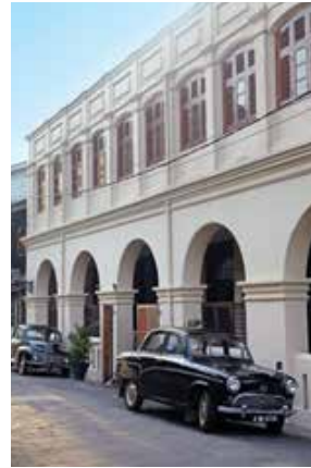
Clockwise from top left: KK Beach's coastal vista; colonial stylings on a Galle street; seafood delight at Bedspace Kitchen; a KK Beach suite